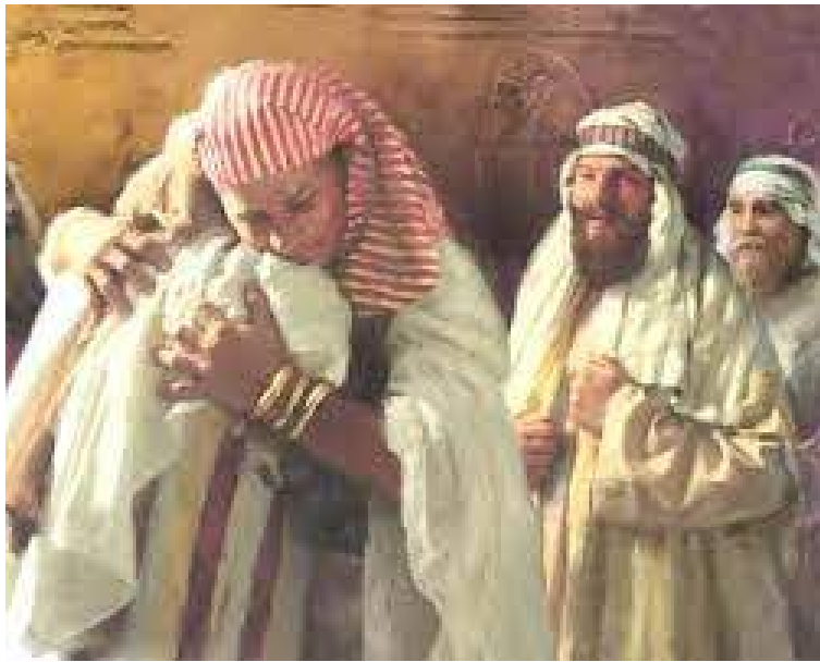
Pharaoh's right-hand man.

Despite the years of hardship and separation from his family, Joseph chose a path of forgiveness and reconciliation when his brothers came to Egypt seeking relief from a famine. In a moment of profound emotional release, Joseph revealed his identity to his brothers, who were terrified, expecting retribution for their actions. Instead, Joseph offered forgiveness, comfort, and provision, recognizing that their actions, though meant for harm, were used by God to preserve a remnant on earth.